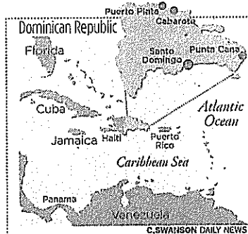
C.SWANSON DAILY NEWS

PALM PLAZA The Museo Alcazar de Colon is in Santo Domingo's old quarter. Left, local crafts are for sale in the beach town of Cabarete.