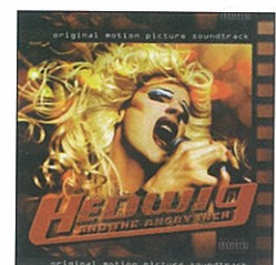
Hedwig and the Angry Inch Original Motion Picture Soundtrack Hybrid Recordings

Hedwig and the Angry Inch is based upon the lofty precept that "to be free, you must give up a little part of yourself." In transsexual Hedwig's case, the little part happens to be his schwanz . For hetero-rockers jonesing for a kinky thrill, what must be given up is the assumption that show tunes blow. The soundtrack recorded for the motion picture version of the original stage play, which opened at the Jane Street Theater in 1998 to hosannas of rare rapture (it was touted as The Most Exciting Rock Score Ever Written For The Theater) is a collection of ballsy rock tunes with the shambolic impact of an 11-foot drag queen falling down a flight of stairs in full KISS regalia.